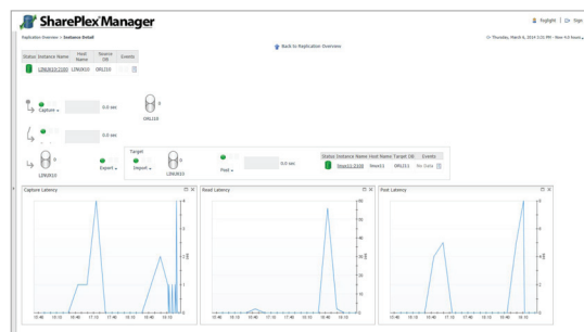
Easily monitor and manage all aspects of your environment through the management console.

Quest helps our customers reduce tedious administration tasks so they can focus on the innovation necessary for their businesses to grow. Quest® solutions are scalable, affordable and simple-to-use, and they deliver unmatched efficiency and productivity. Combined with Quest's invitation to the global community to be a part of its innovation, as well as our firm commitment to ensuring customer satisfaction, Quest will continue to accelerate the delivery of the most comprehensive solutions for Azure cloud management, SaaS, security, workforce mobility and data-driven insight.